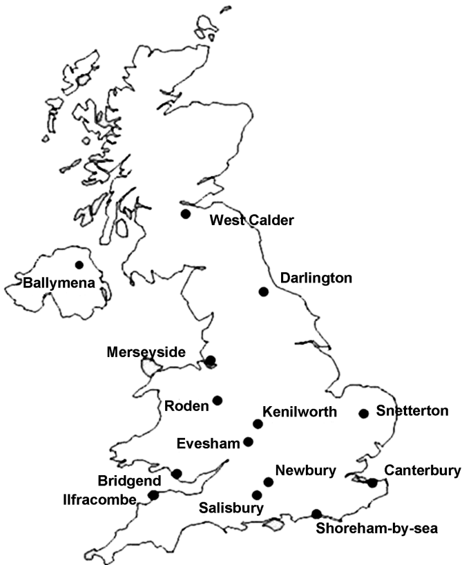
FIGURE 1 The map shows the location of 14 Dogs Trust rehoming centers used in the study.

The researchers attempted to obtain data from all 15 Dogs Trust centers in operation at the start of the study, but one center had to be excluded because it did not have computerized records. The owners of all dogs who were relinquished at 14 of the Dogs Trust's rehoming centers (Figure 1) were required to complete a questionnaire that included information about the reason for relinquishment,